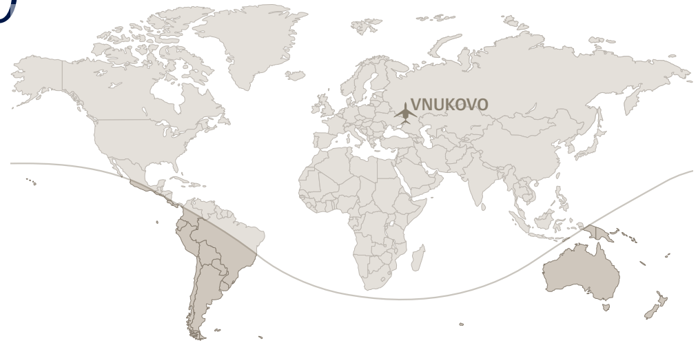
CHALLENGER 300 RANGE OUT OF VNUKOVO

This map is a schematic representation only.