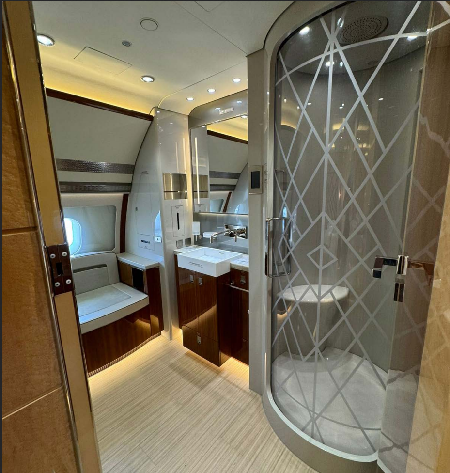
VIP MASTER BATHROOM