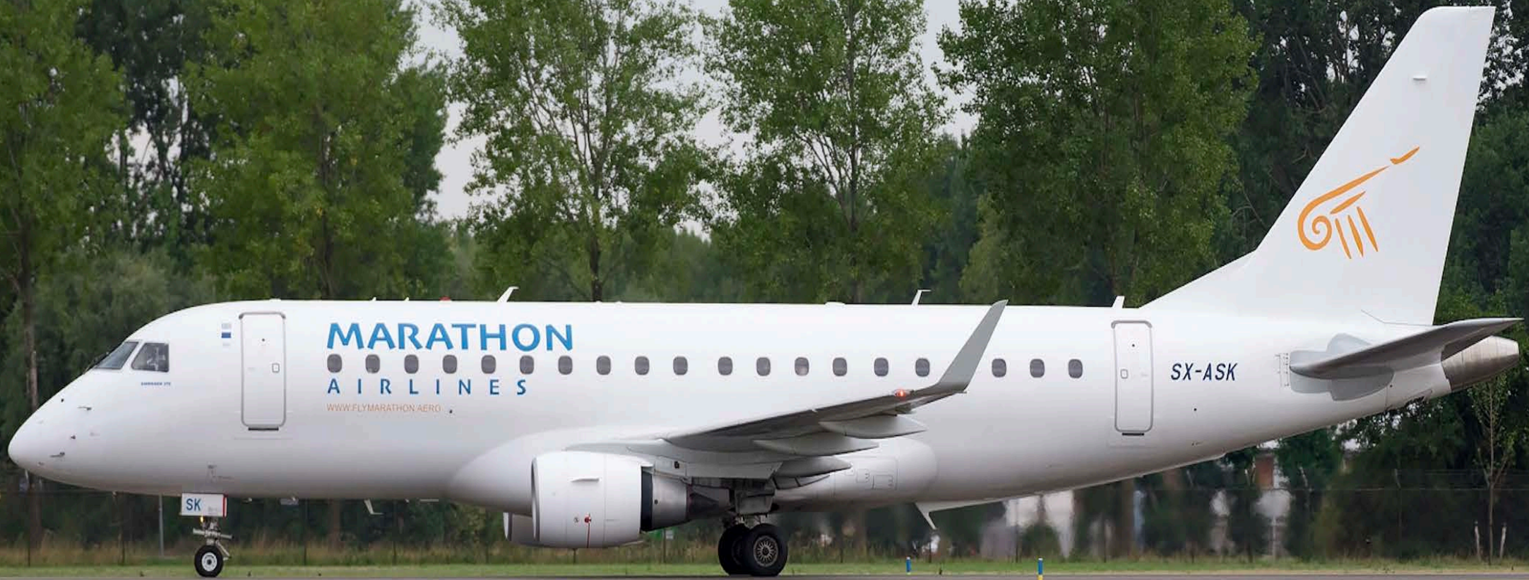
EMB 175 STD SX-ASK