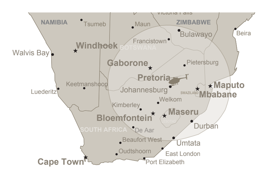
BELL 430 RANGE OUT OF LANSERIA

This map is a schematic representation only.