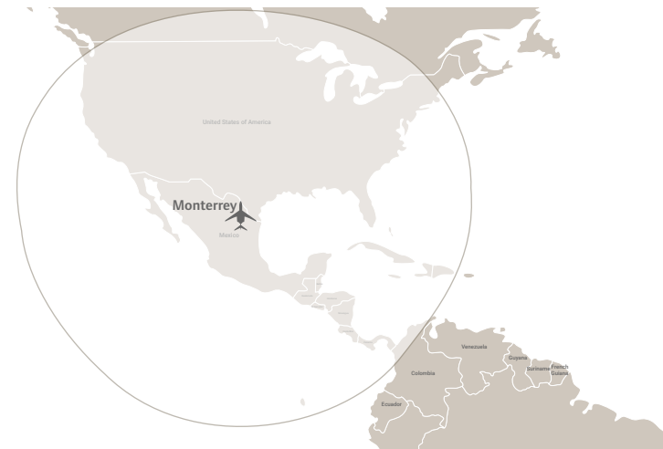
PILATUS PC-12 RANGE OUT OF MONTERREY

This map is a schematic representation only.