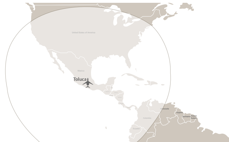
LEARJET 60 RANGE OUT OF TOLUCA

This map is a schematic representation only.