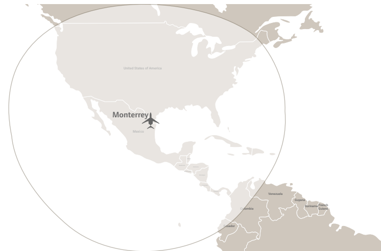
LEARJET 60 RANGE OUT OF MONTERREY

This map is a schematic representation only.