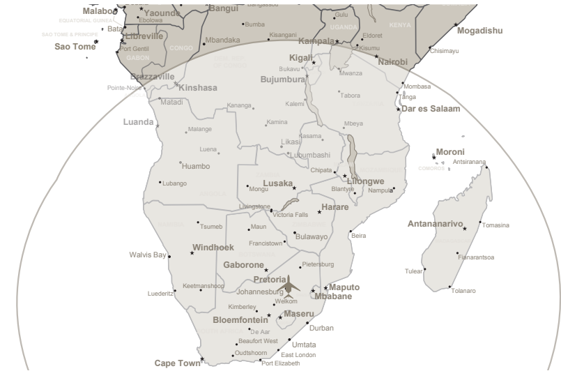
PILATUS PC-12 RANGE OUT OF LANSERIA

This map is a schematic representation only.