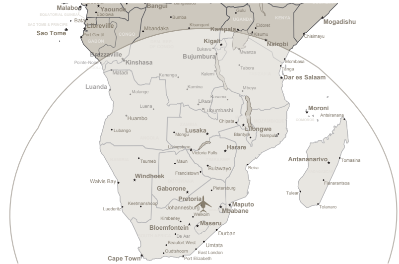
PILATUS PC-12 RANGE OUT OF LANSERIA

This map is a schematic representation only.