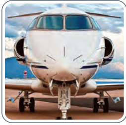
Bombardier Challenger 350