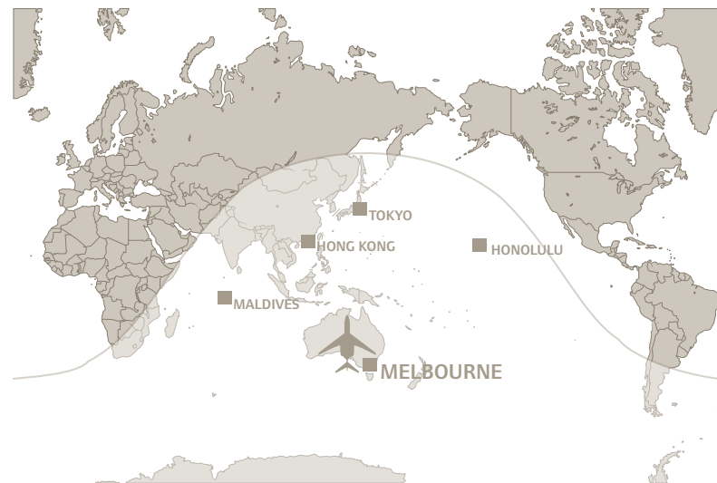
GLOBAL XRS RANGE OUT OF MELBOURNE

This map is a schematic representation only.