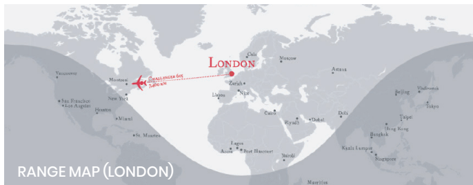
RANGE MAP (LONDON)