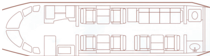
STANDARD INTERIOR CONFIGURATION