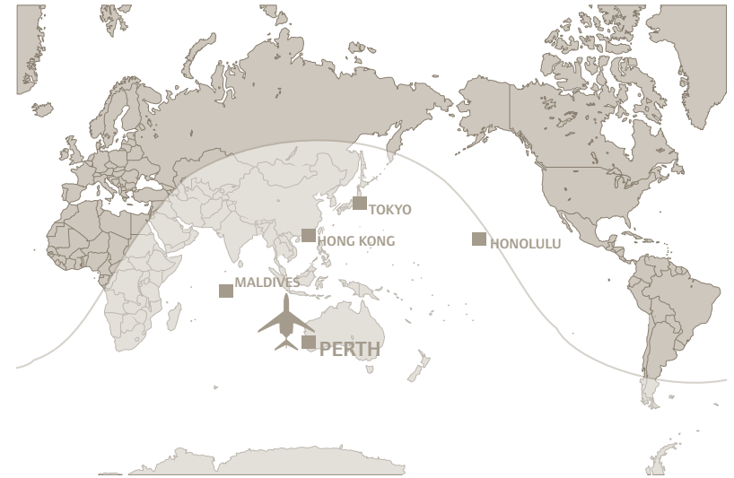
GLOBAL EXPRESS XRS RANGE OUT OF PERTH

This map is a schematic representation only.