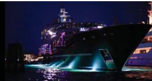
Far right: Seaforce One