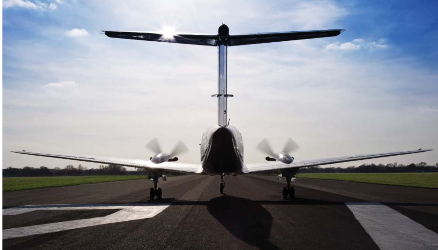
Top right: Synergy Aviation King Air. Bottom second: Airbus ACJ interior – operated by Comlux. Bottom far right

The last thing you want in the middle of a busy schedule is information overload. But if, like many of our clients, you would like some calm reassurance that everything is on schedule, we are happy to offer a pre-flight text messaging service. Three hours before your flight, we will send you an SMS confirming your departure airport and time, your aircraft tail number, and the names of your Captain and crew. These messages will only be sent on request, so please just ask your Flight Service Manager.