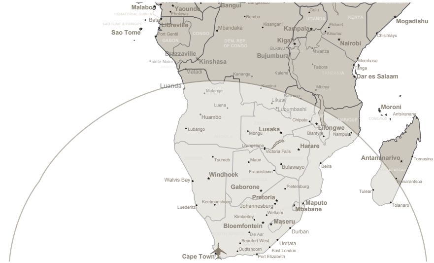
PILATUS PC-12 RANGE OUT OF CAPE TOWN

This map is a schematic representation only.