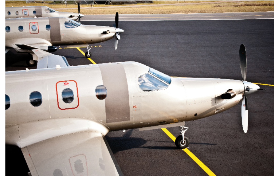
Pilatus PC-12 by JetFly Aviation