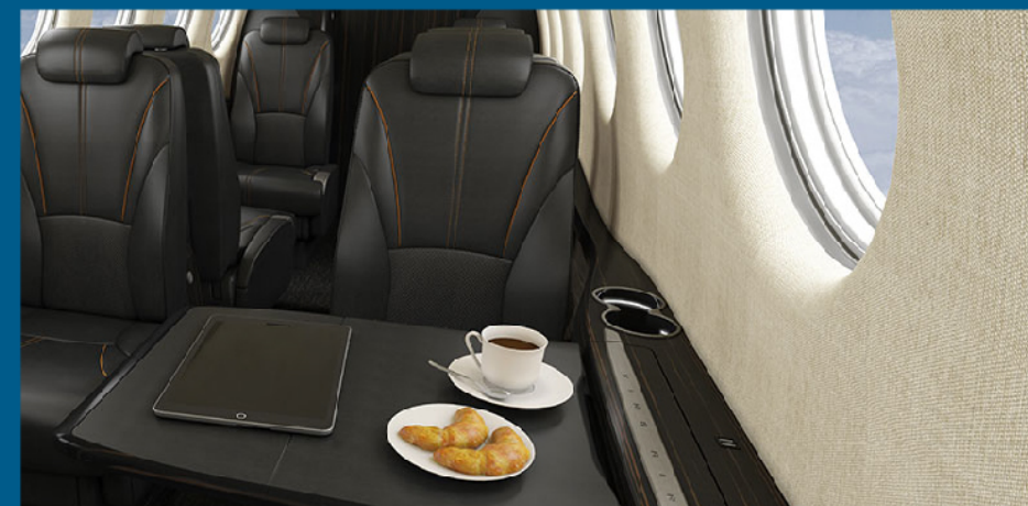
King Air 360 by Textron Aviation