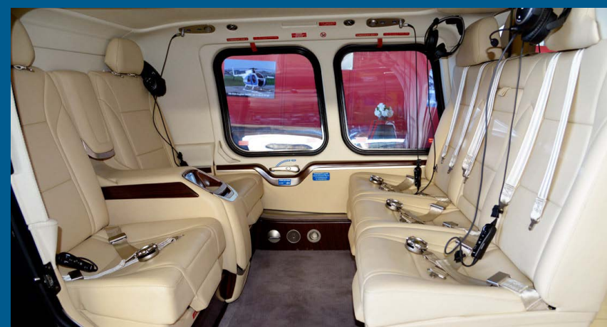
Agusta AW109SP Grand New by Mountain Flyers