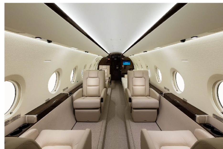
Gulfstream G280 by Alpine Sky Jets