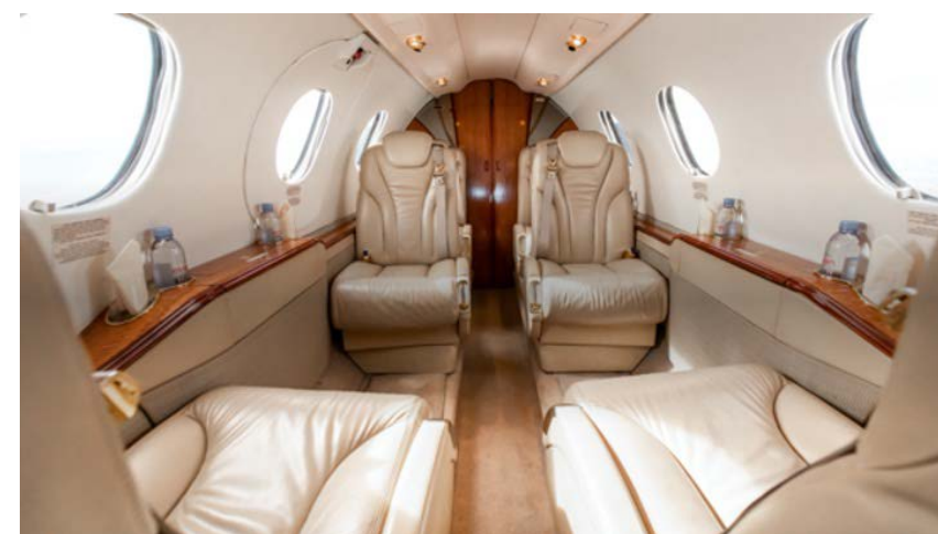
Beechcraft Premier 1A – D-ISAR Swiss Global Jet operated by Jet Pool Network