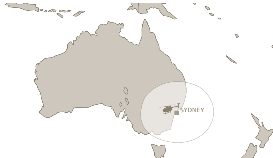
RANGE OUT OF SYDNEY

This map is a schematic representation only.