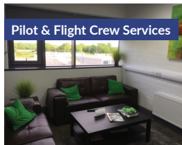
Pilot & Flight Crew Services