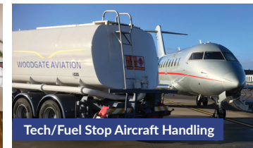
Tech/Fuel Stop Aircraft Handling